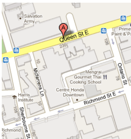
Fred Victor Employment & Training Services 248 Queen Street East

Please contact us to sign up for an Orientation Session: 416-364-8986, ext. 550 (Please set aside 2 hours for the Orientation Session)